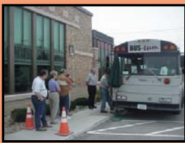
BUS-eum, a traveling TRACES exhibit

The 34th Division served the longest stint of active duty of U.S. Army Divisions in WWII--611 days. In February 1943 some 1,800 mostly Iowa, but also Minnesota and Dakota soldiers fell prisoner to Rommel's men; they were marched to Tunis, flown to Naples, then shipped in box cars to Nazi Germany, where they spent two years as "Hitler's uninvited guests." Those who survived that living hell returned to America's Heartland forever changed.